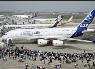
Aerospace and Satellite Imaging