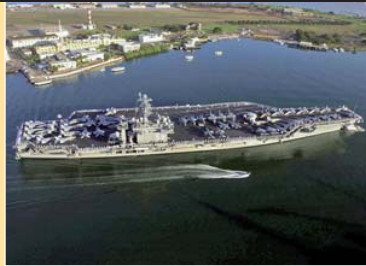
Aeronautics &amp; Naval Architecture