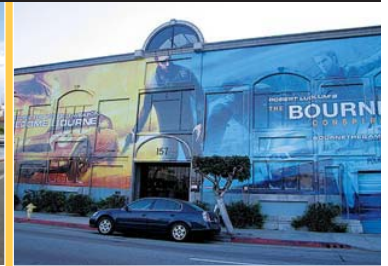
Artwork &amp; Graphics